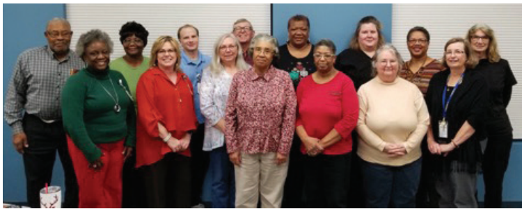
Participants are pleased with the weight loss and increased activity of the Prevent T2 program.

"This diabetes prevention program is designed for people who have pre-diabetes or are at risk for type 2 diabetes, but who do not already have diabetes. We also allow participants with diabetes to participate," states Koch, who is a trained lifestyle coach.